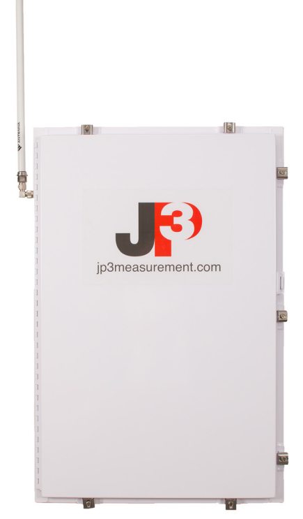
JP3 Verax CTX Analyzer: Capable of measuring natural gas up to 1650 BTU/SCF without sample conditioning

Multi-Stream Measurement of BTU, Hydrocarbon Composition (C1-C6+), Relative Density, and CO2 in Natural Gas