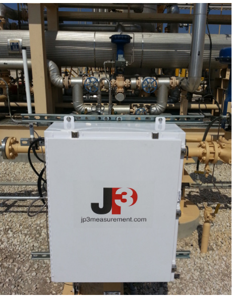
Typical Installations at Customer Sites: Verax CTX control panels, and optical probes

For more information: sales@jp3measurement.com 512.537.8450 4109 Todd Lane, Suite 200 Austin, Texas 78744 jp3measurement.com