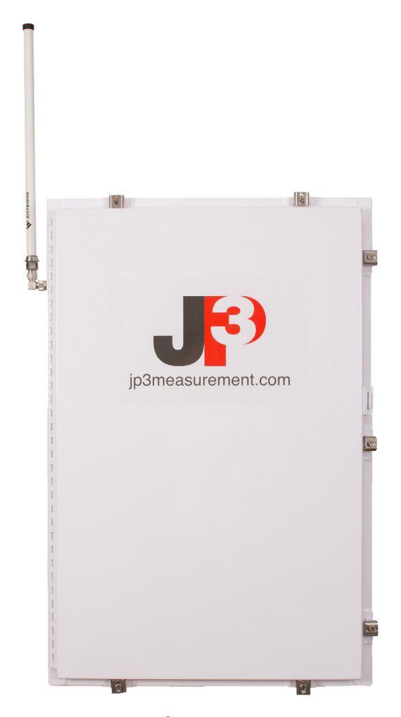
JP3 Verax CTX<sup>e</sup> Analyzer

Multi-Stream Measurement of Hydrocarbon Composition, API Gravity, Vapor Pressure, BTU, and Other Properties in Natural Gas, NGL, Condensate, Crude Oil and Refined Products