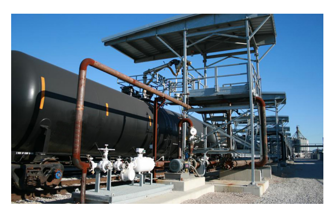
Rail Loading Terminal

This huge increase in product movement on road and rail has strained the existing terminal loading infra-structure. Today, product must be on- or off-loaded safely, accurately and as quickly as possible. However, traditional methods of measuring product volatility, or Vapor Pressure, are necessarily slow and require extensive sampling system or, worse, manual sampling to effectively operate. In addition, in order to accurately follow existing methods for RVP (D323) and VPCR (D6377), the product must be brought to 100F, which often causes clogging of the sampling apparatus, and thereby renders traditional vapor pressure analyzers useless while further increasing maintenance and operating costs.