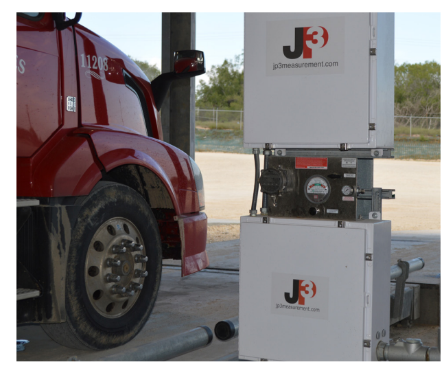
Verax™ VPA Installation

Verax VPA is currently in use at midstream facilities, loading/unloading terminals and on pipelines across most of the major oil & gas basins in the United States.